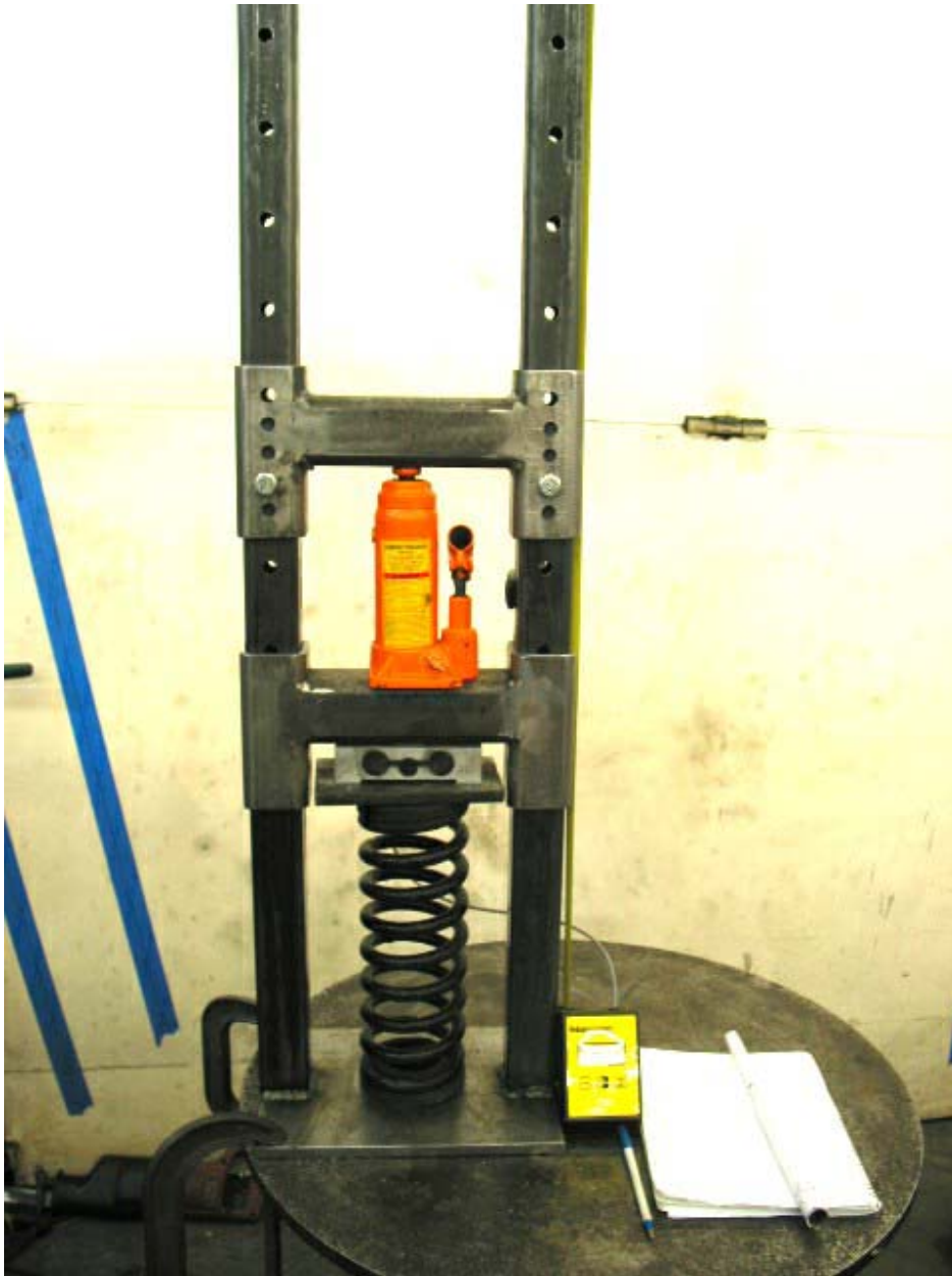
Rear E31 spring