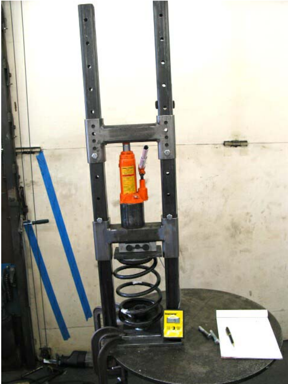
Front E31 OEM CSI spring.