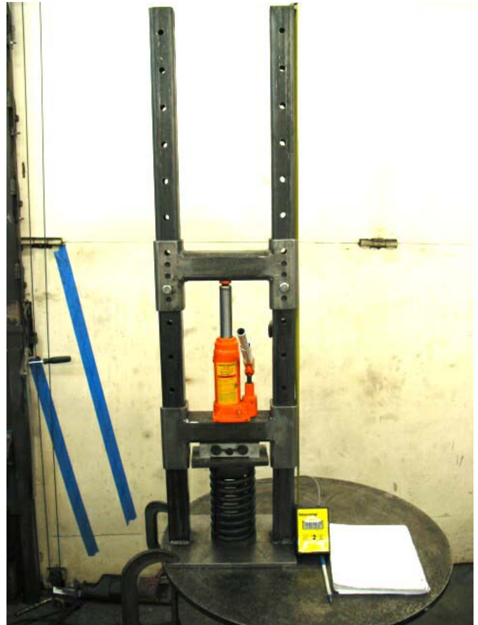
Rear E31 spring compressed