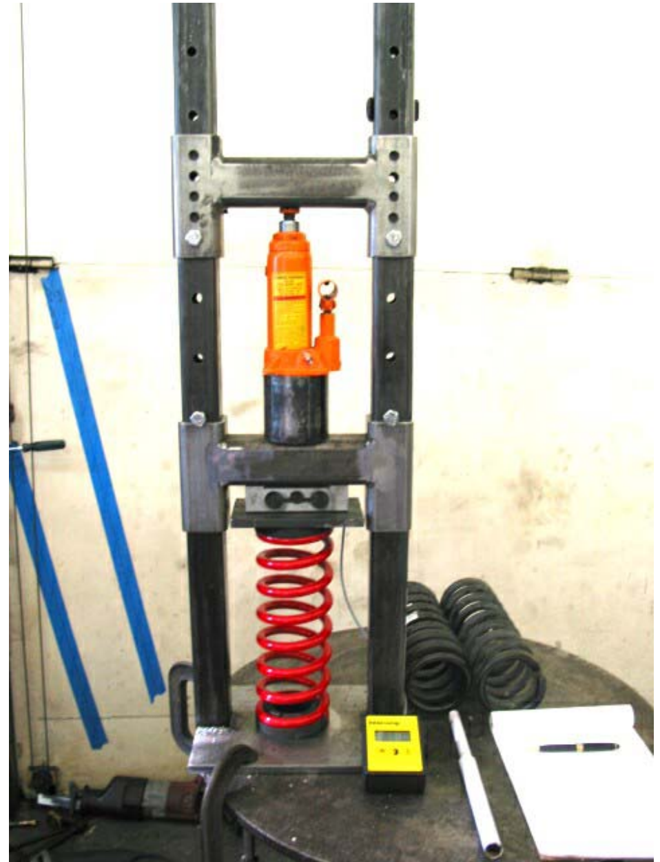
Rear E31 H&R Spring