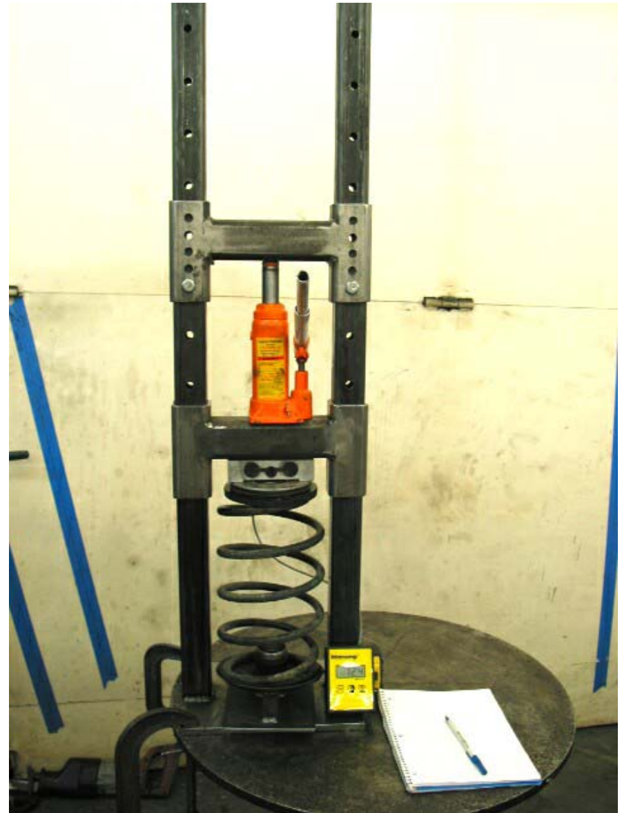
Front E31 OEM spring.