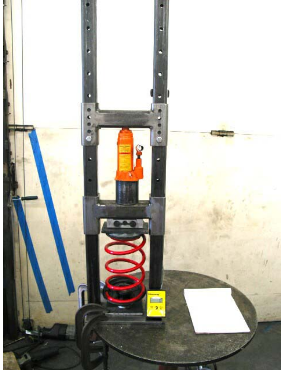
Front E31 H&R spring