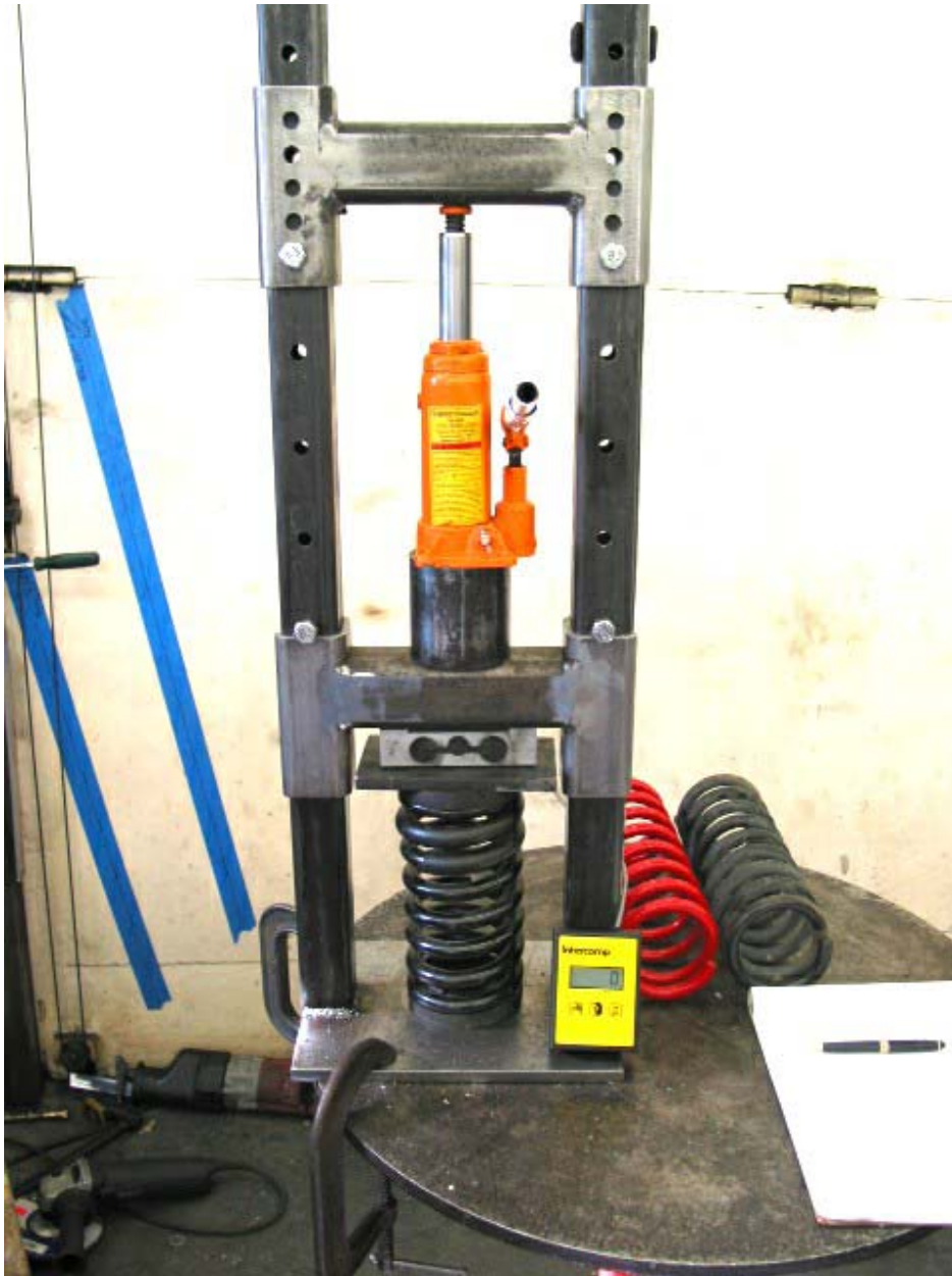
Rear E31 CSI spring